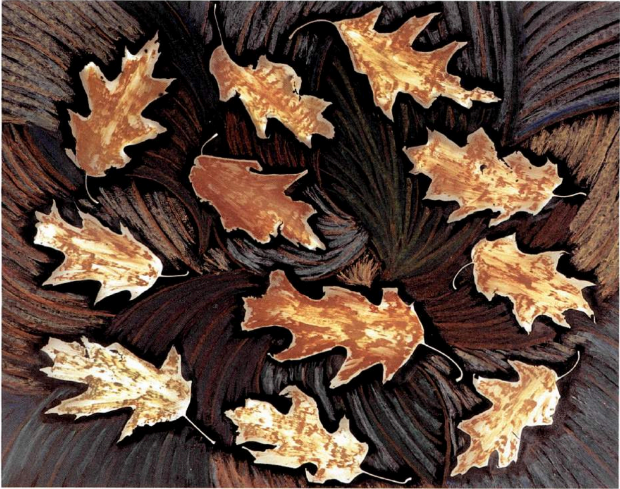
Dynamics of a Blowing Leaf